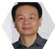
戴跃教授 华东师范大学, 中国